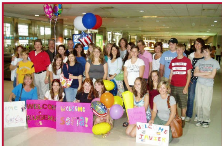
A group of host families waiting for the arrival of their host brothers and sisters at the airport

"We had a lot of fun sharing our cultures. We shared laughter, jokes and card games. We miss our host brother a great deal! We may even travel and visit him next summer!!"