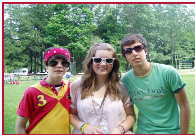
Host brothers and sisters sharing some summer fun together under the sun