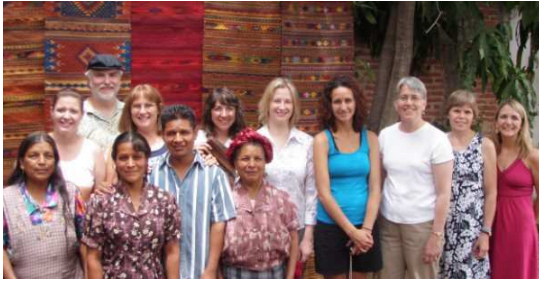
Educators with the Mendoza family weavers.